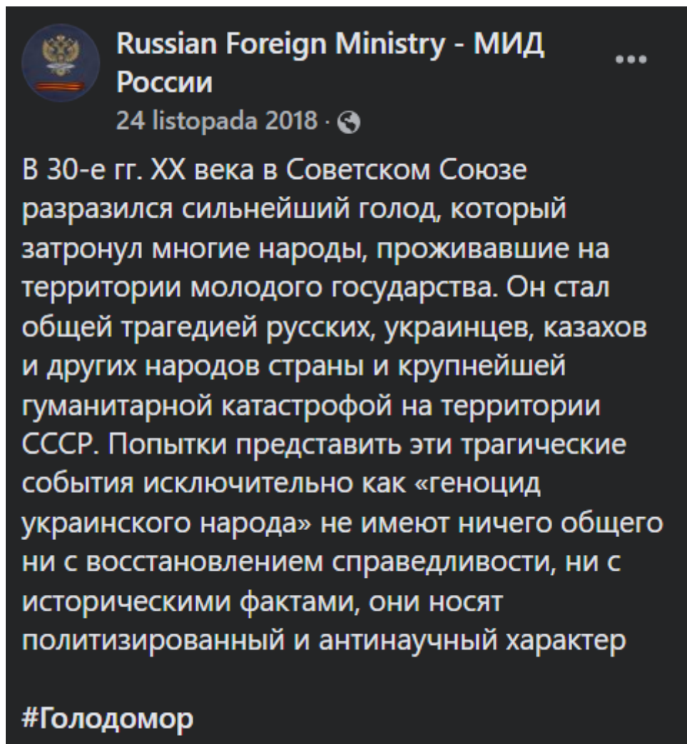
Figure 5 A message of 24 November 2018 published by the Russian Foreign Ministry on its official FB profile 9

In the 1930s, a severe famine broke out in the Soviet Union, affecting many peoples living on the territory of the young state. It became a common tragedy for Russians, Ukrainians, Kazakhs and other nations of the country and the greatest humanitarian disaster on the territory of the USSR. Attempts to present these tragic events solely as the 'genocide of the Ukrainian people' have nothing to do with restoring justice or historical facts, and are politicised and anti-scientific in nature.