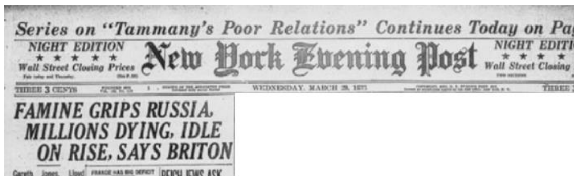
Figure 1 Excerpt from the New York Evening Post from 29 March 1933

A report on Gareth Jones's press conference published in the New York Evening Post on 29 March 1933 1